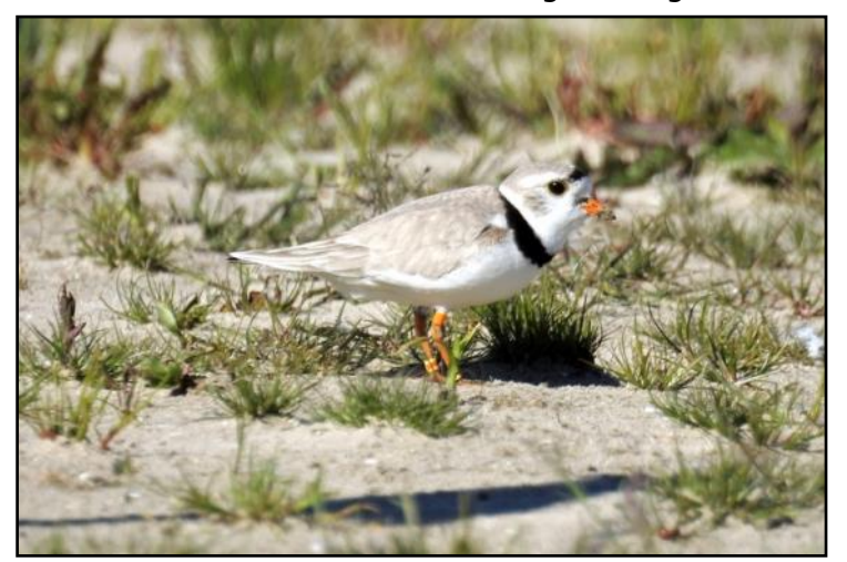
Dad with numbered band

Then, this year three birds, hatched at Wasaga Beach in 2015, showed up at Presqu'ile in mid-May. Instead of moving on, the birds started exhibiting breeding behaviour! Two males were courting the single female.