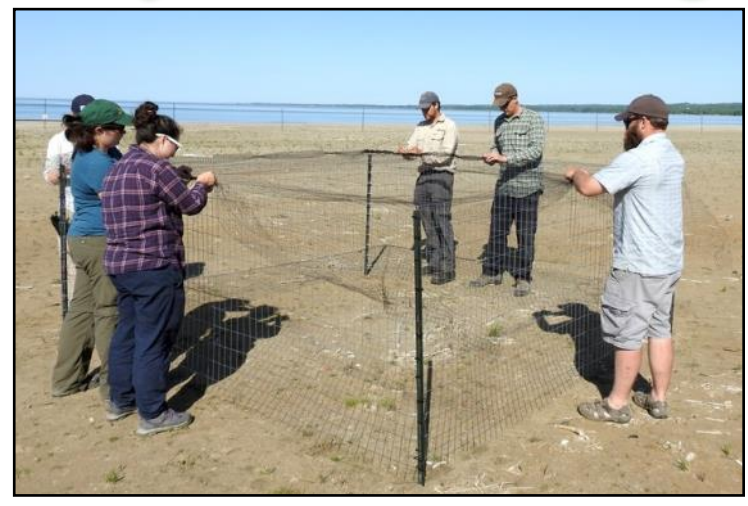
Building nest enclosure at Presqu'ile

The other thing we needed were people to keep an eye on the birds and tell other beach goers about them and why certain areas of the beach could not be used. An appeal went out from The Friends' website, which was