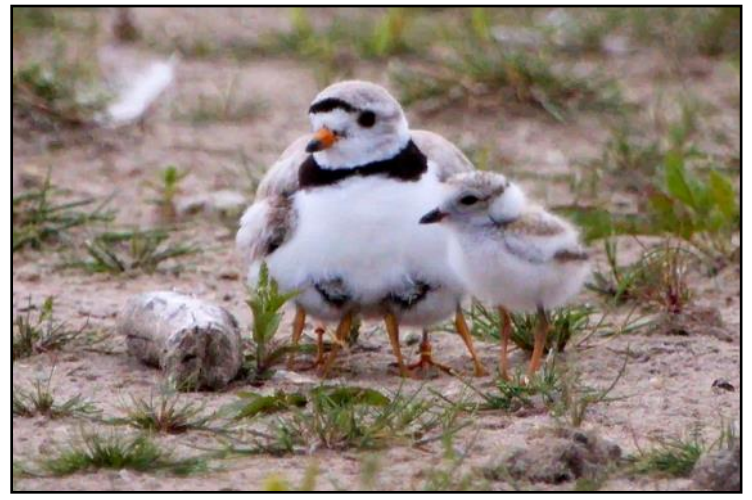
Piping Plover chicks warming up under adult wing. At 7 days, they are so big that the third chick has to wait its turn to fit.