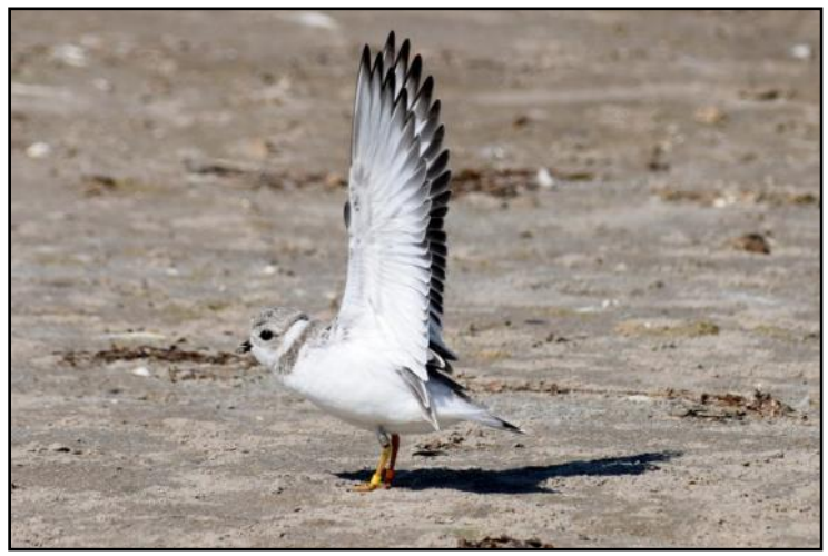
Plover chick stretching its wings, getting ready to fly away