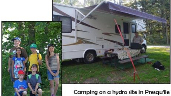
Kids 'n Nature