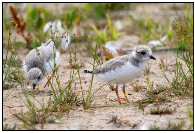
2 4-week old chicks, July 24