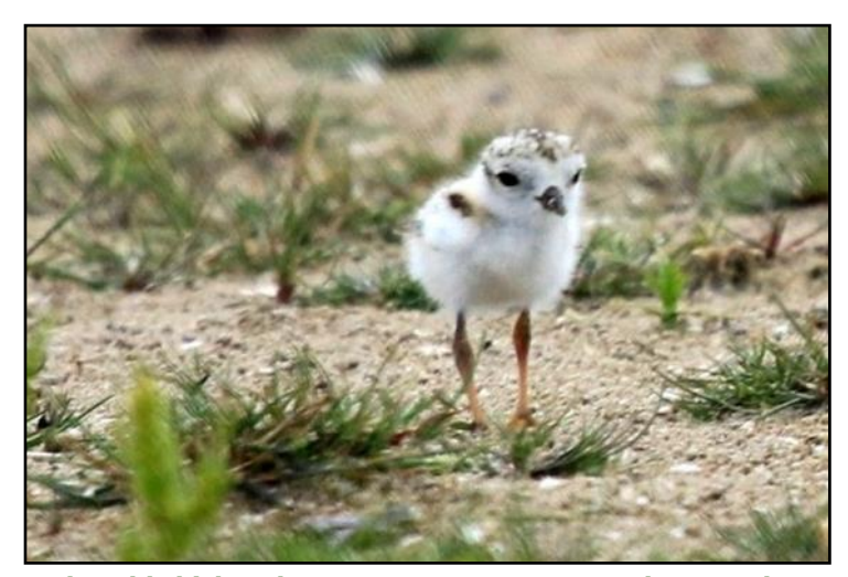
3-day old chick, July 1

After a start-up orientation meeting, three three-hour shifts a day were organized of 1 or 2 volunteers to set up on the beach and be Plover Monitors . Monitoring started on June 23 and really picked up after the chicks hatched on June 28.